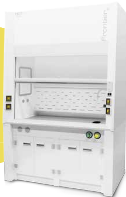
Esco Frontier PPH Fume Hood Model PPH-5UDPWW-8